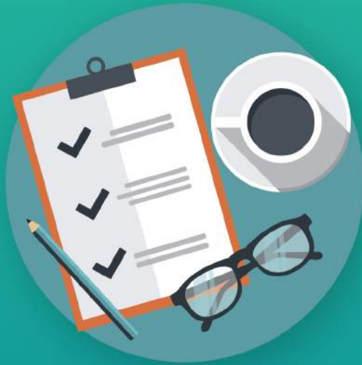
Creation/writing a description