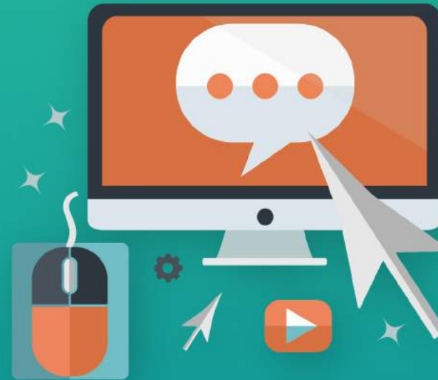
Creating button on site